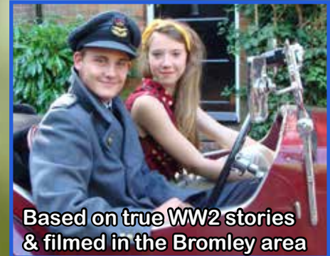
Based on true WW2 stories & filmed in the Bromley area

Cold refreshments & 1940's entertainment in the courtyard afterwards until c.5:30 pm, weather permitting!